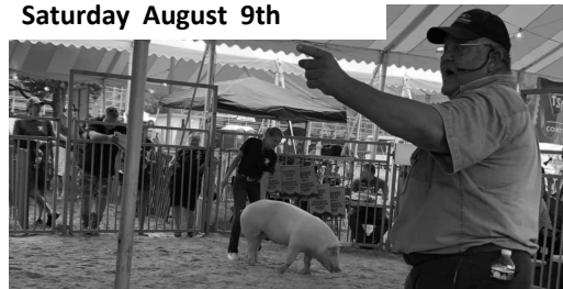
11 a.m. 4-H Livestock Buyers' Luncheon