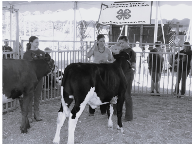
10 a.m. 4-H & Open Breeding Beef, 4-H Market Steer, 4-H Dairy Beef