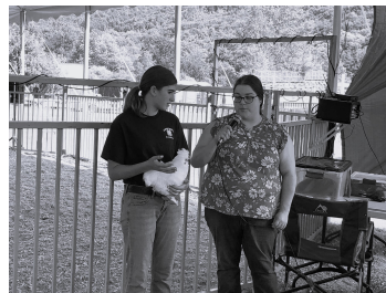
3 p.m. 4-H Poultry Show