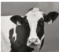
10am Dairy Show