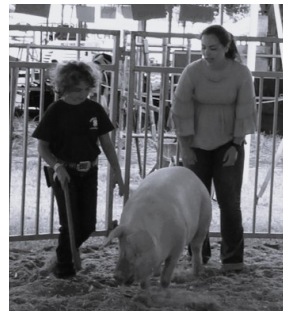
10 a.m. 4-H Market Swine