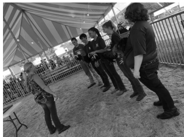
7:30 p.m. 4-H Showmanship Contest