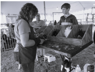
10 a.m. 4-H & Open Rabbit & Cavies