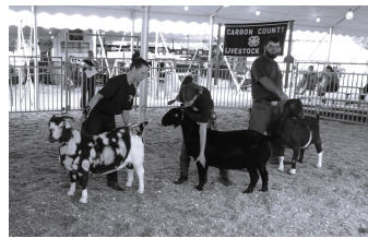
2 p.m. 4-H & Open Goat Show