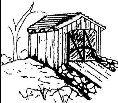
Covered Bridge Little Gap Village, PA

LOWER TOWAMENSING TOWNSHIP 595 Hahns Dairy Road, Palmerton PA 18071 Tel: 610/826-2522 Fax: 610/826-2585