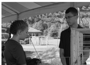
10 a.m. 4-H Poultry Showmanship