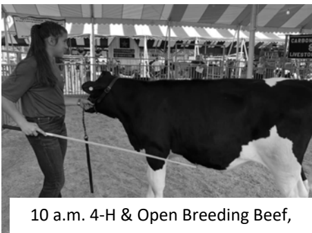
10 a.m. 4-H & Open Breeding Beef, 4-H Market Steer, 4-H Dairy Beef