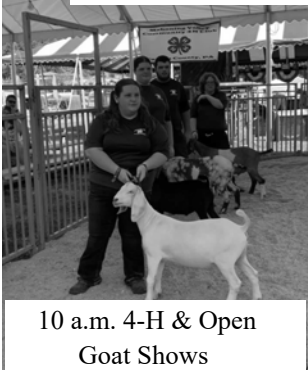
10 a.m. 4-H & Open Goat Shows