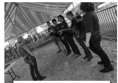
5 p.m. 4-H Showmanship Contest