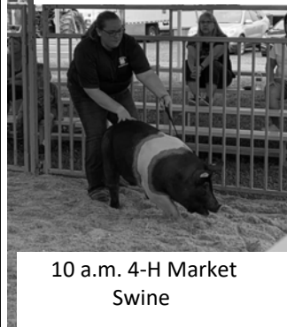
10 a.m. 4-H Market Swine