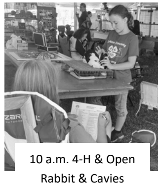
10 a.m. 4-H & Open Rabbit & Cavies