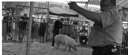
11 a.m. 4-H Livestock Buyers' Luncheon